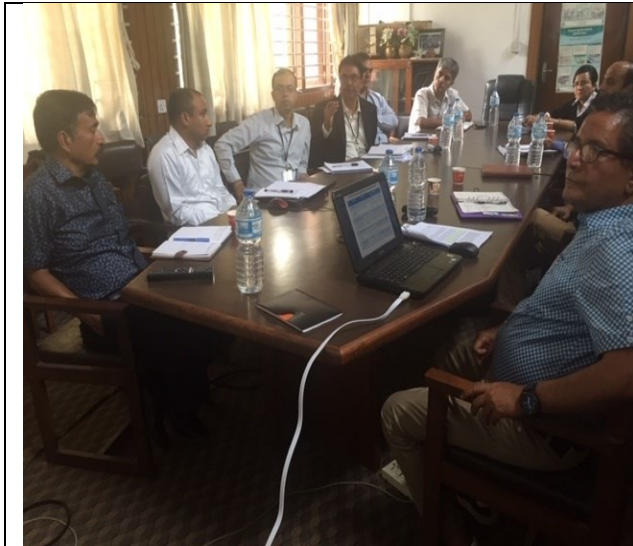
Consultation Meeting on Environmental Safeguard attended by representative from ADB, PMC and DSC P-7 Municipalities