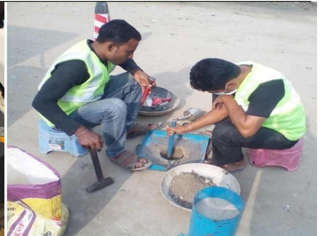
Conducting the Base Course Field Density test – R6, Biratnagar