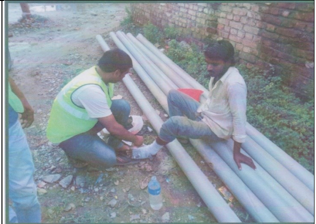
Safety engineer providing First aid treatment to injured labour, Biratnagar