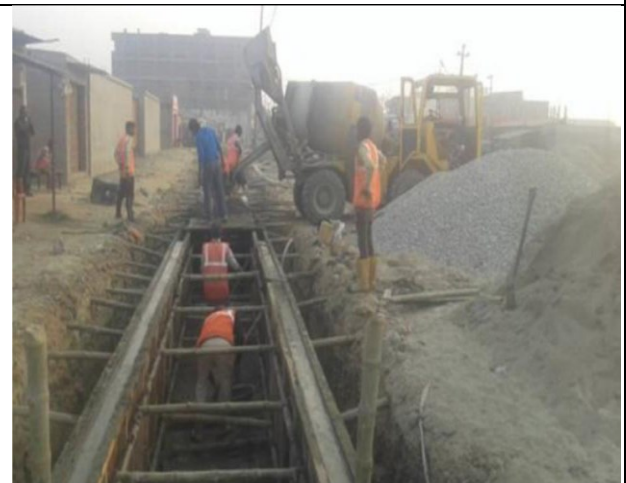
Construction of RCC Storm Water Drain on progress, Birgunj