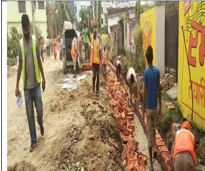
Brick work for road side drain at T3 Trunk (Sunhat to Tapariya eye Hospital), Biratnagar