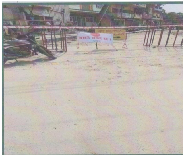
Road safety measures adapted at different roads