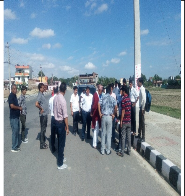
Monitoring all roads under RUDP by Monitoring team, Siddharthanagar