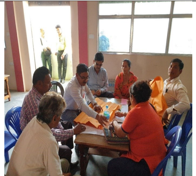
Group work on Urban Development Plan of Suklaphanta