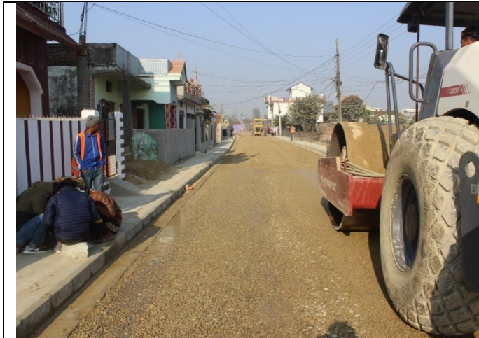
Base Course Finishing work at Karkanda Road, Nepalgunj