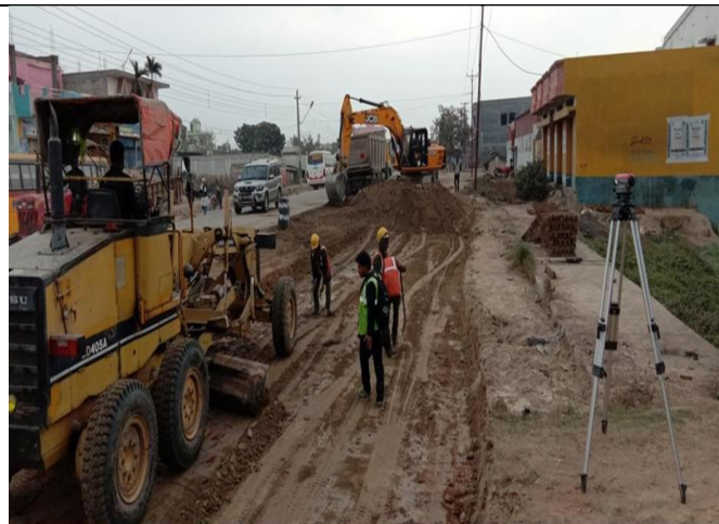
1st By-Pass, Preparation of Sub Grade and Sub-Base Work, Birgunj